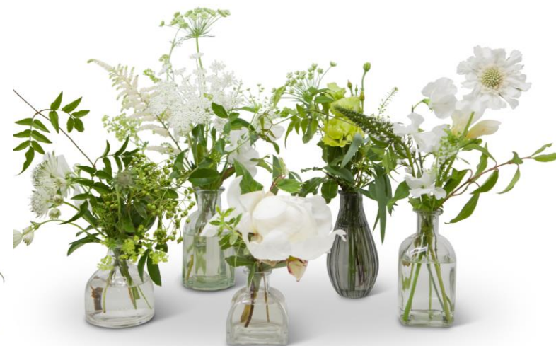
CLUSTER OF 5 STEM VASES