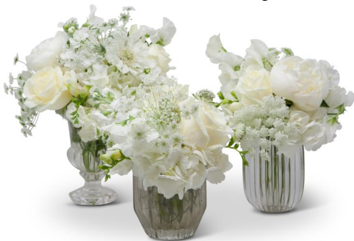
TRIO OF VASES