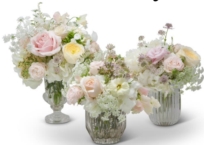
TRIO OF VASES