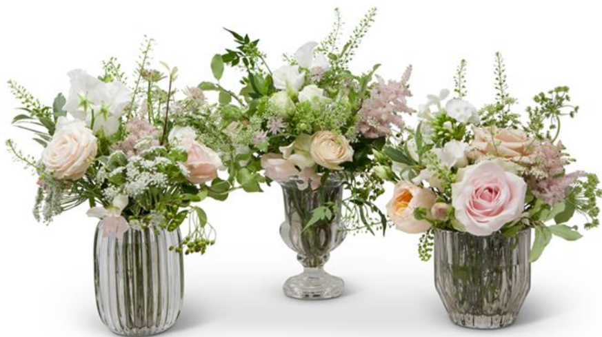
TRIO OF VASES