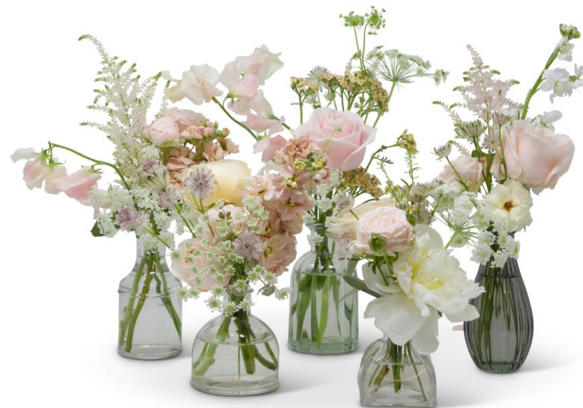
CLUSTER OF 5 STEM VASES