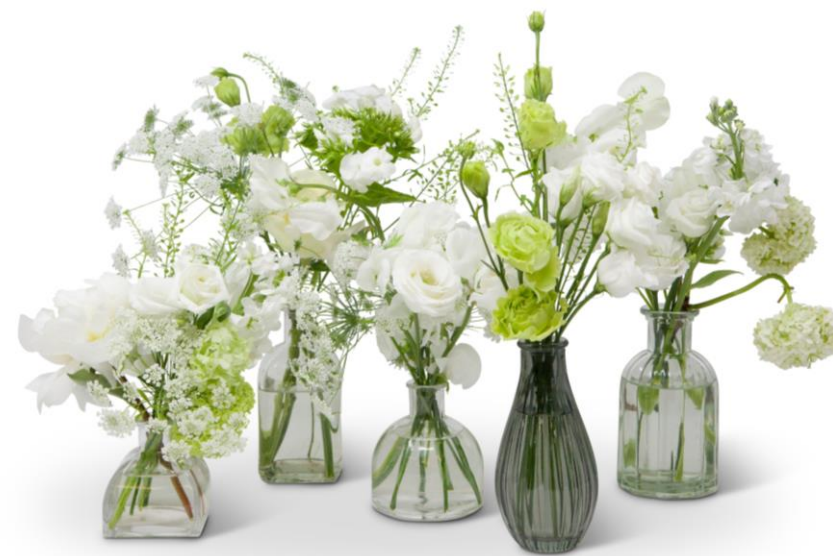
CLUSTER OF 5 STEM VASES