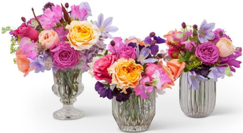
TRIO OF VASES