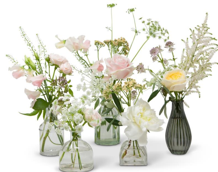
CLUSTER OF 5 STEM VASES