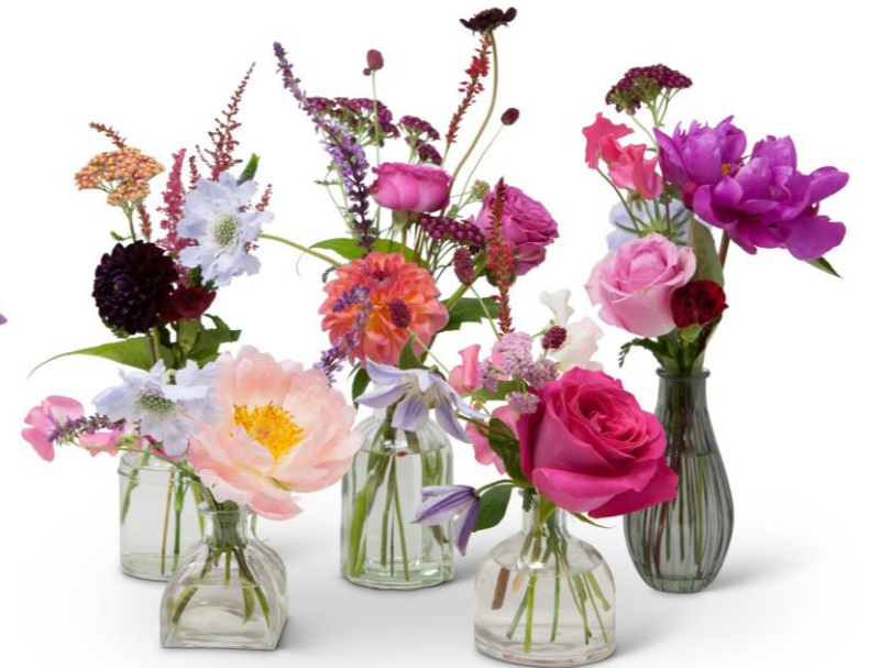
CLUSTER OF 5 STEM VASES