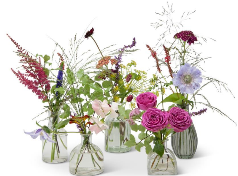
CLUSTER OF 5 STEM VASES