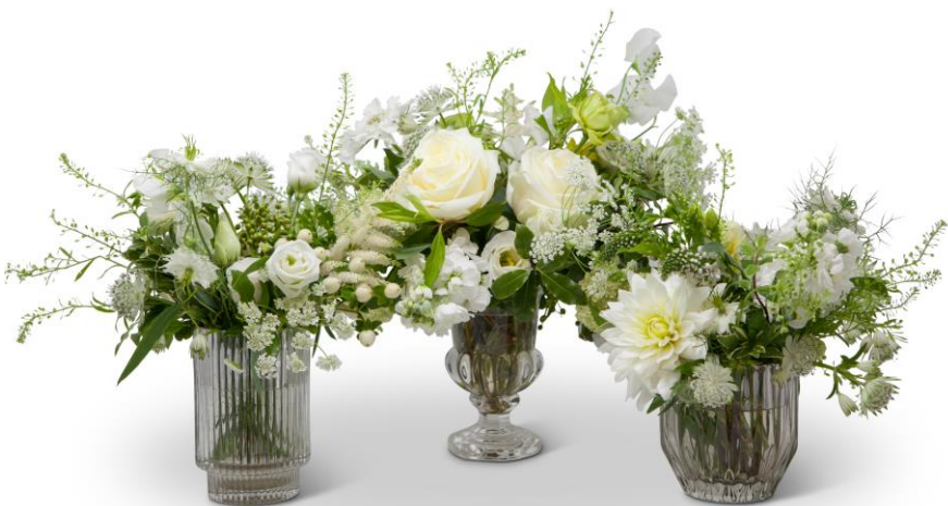
TRIO OF VASES