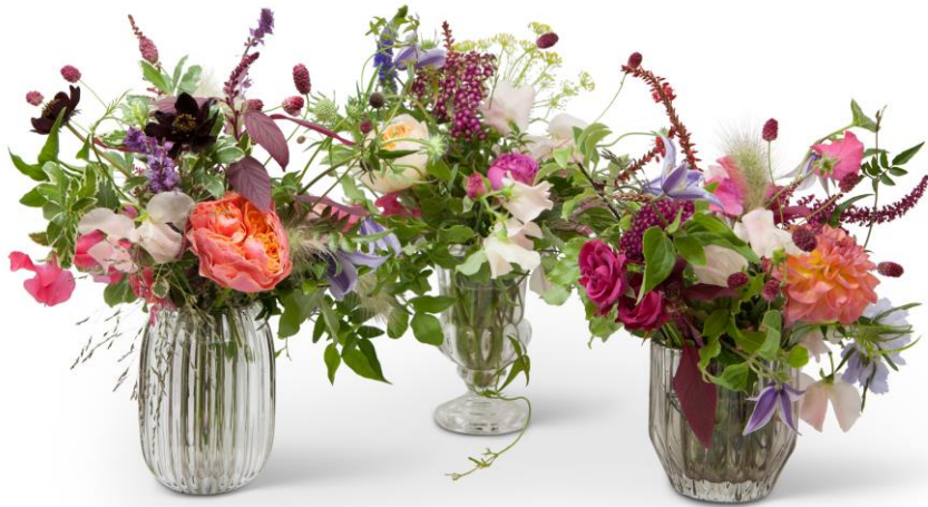
TRIO OF VASES